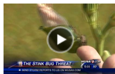
USDA Combats Stink Bugs