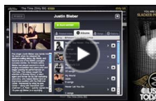
Talking Tech | Slacker's new Music Subscription Program